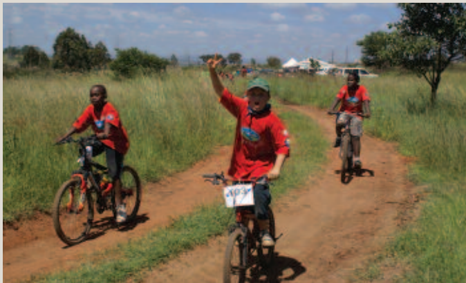
Kate to supply picture