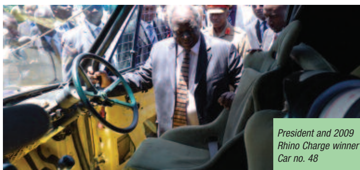
President and 2009 Rhino Charge winner Car no. 48