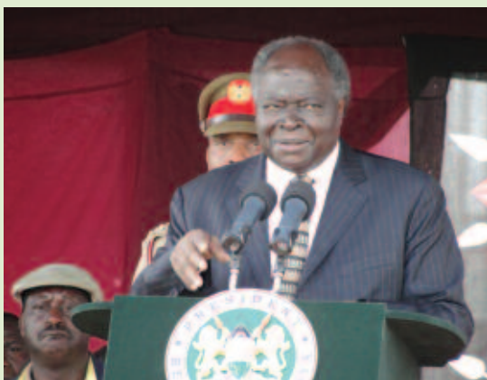
President Mwai Kibaki – ‘Maintenance a daily challenge’