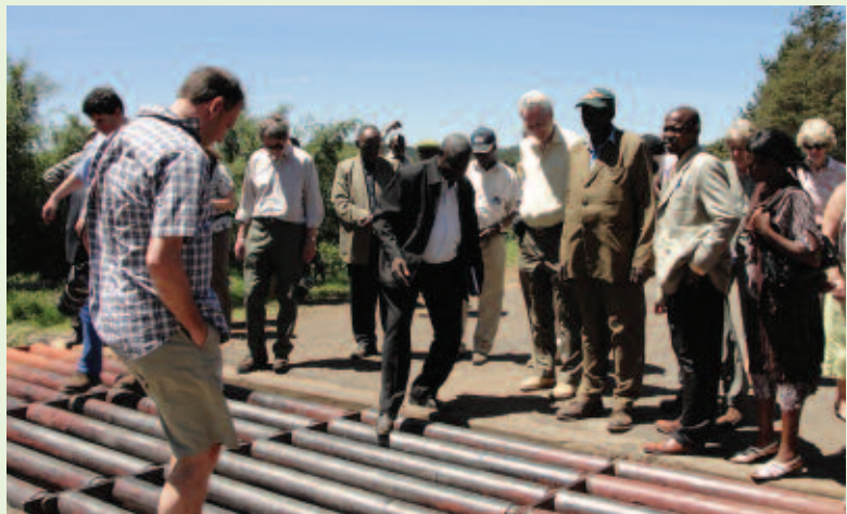
Visitors test Safaricom Foundation's elephant grid at Kieni

The UK and US Charities have tax beneficial facilities for all fund raising sources and especially provide the Kenya and UK Rhino Charge donations with on line donation facilities – justgiving.com/charity/rhinoark firstgiving.com/RhinoArkCharitableTrustInc