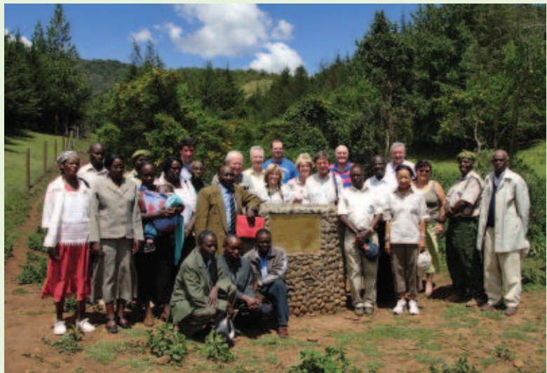
UK/US Trustees at the Final Post plaque with Kipipiri fence build groups Kipkiama Cecaife and Gita.