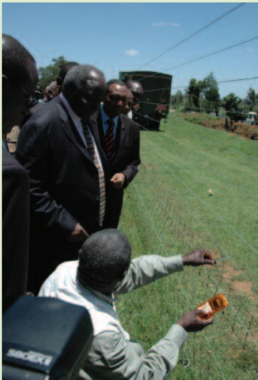
President powers up fence