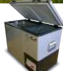
Auto Fridge / Freezers