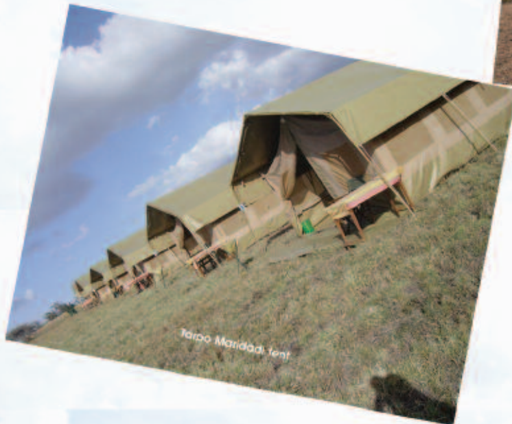
Tarpo Maridadi tent