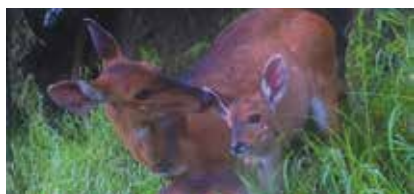
Female bushbuck with calf