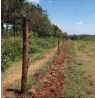
Rehabilitation of the Aberdare Fence Phase 1 on-going at TreeTops