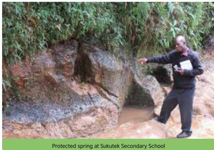
Protected spring at Sukutek Secondary School