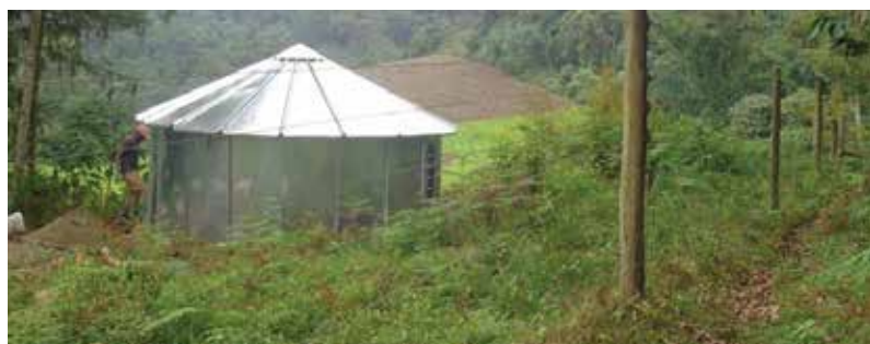
New fence attendant guard posts