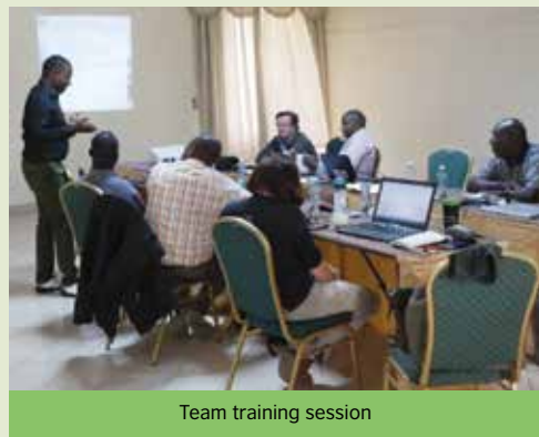
Team training session

Project field work undertaken by Rhino Ark staff calls for a mix of both technical and people skills, and Rhino Ark is investing in its field staff through training.