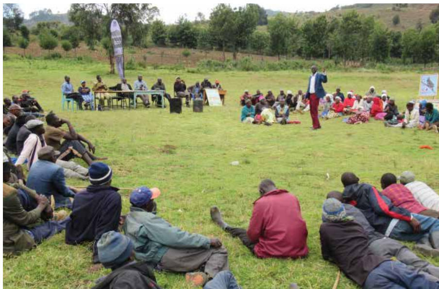
Outreach session at Songoloi

energy solutions and training, best agricultural practices, ecotourism and participation in the community forest association. Experts in these various aspects provided relevant advice and training to the communities that participated in the barazas.