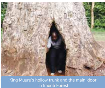
King Muuru's hollow trunk and the main 'door' in Imenti Forest