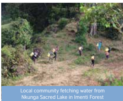
Local community fetching water from Nkunga Sacred Lake in Imenti Forest