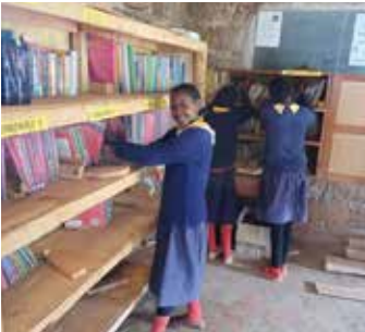
Pupils in-charge of SOH-Wanjerere library

Rhino Ark in partnership with ChallengeAid Trust, a UK based charitable trust, donated text books to SOH Wanjerere, SOH-Bondenini and SOH-Njogu-ini.