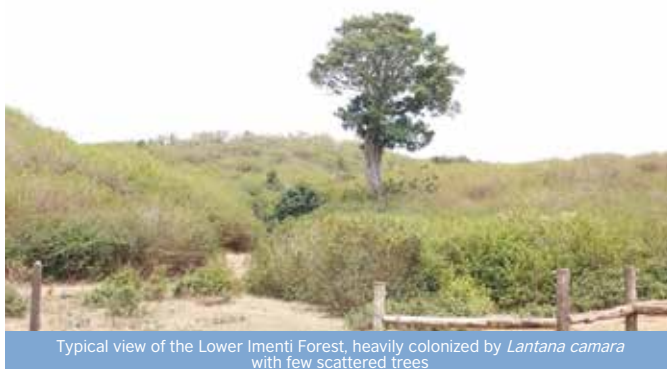
Typical view of the Lower Imenti Forest, heavily colonized by Lantana camara with few scattered trees