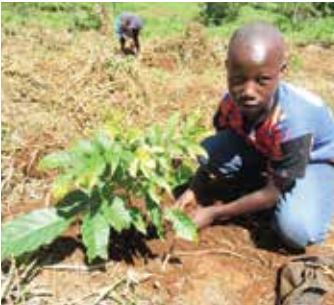
Pupils and members of SOH-Wanjerere participated in tree-planting within their school compound