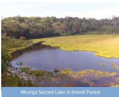
Nkunga Sacred Lake in Imenti Forest