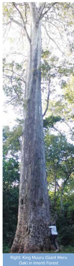
Right: King Muuru (Giant Meru Oak) in Imenti Forest