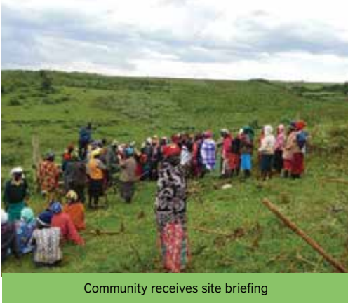
Community receives site briefing

The long standing challenges of livestock overgrazing, illegal logging, charcoal burning, illegal settlements and encroachment have significantly impacted on the forest cover in the South Western Mau Forest Reserve. Large areas of previously pristine indigenous forest are now heavily degraded. To address this challenge, much forest rehabilitation is required.