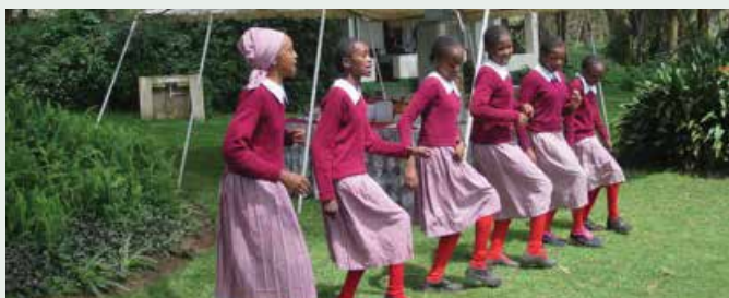
Girls from Ndibithi Primary School in a competition performance

The 2018 Eburu’s Got Talent was a song, dance and poetry competition featuring the mountain bongo and the Eburu Forest subject matter. The primary goal of ‘Eburu’s Got Talent’ was to sensitize the local forest-adjacent communities to the plight of the critically endangered mountain bongo and instil them with a deep understanding of the need for sound forest conservation. The competition was organized over a 4-month period from March to June 2018. A panel of community judges was selected each weekend for the various preliminary competitions between the 32 Wildlife Clubs in schools adjacent to the forest.