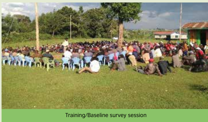
Training/Baseline survey session

Beekeeping is practiced by forest adjacent communities in the South Western Mau area. However, there is potential for the communities to expand their honey production and earn more revenue by increasing the number of hives and the quality of production techniques. Under the Initiative for Sustainable Landscapes Initiative (ISLA), funding support for bioenterprise has been provided to Rhino Ark by the Safaricom Foundation to support the local communities to maximize on potential market opportunities in production and sale of honey and related products.