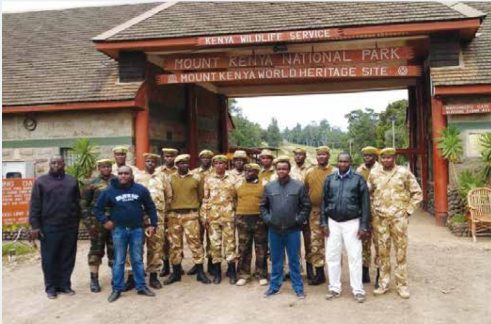
Rangers after the training session

In partnership with ESRI, one of the worlds' largest mapping software company and Kenya Wildlife Service, Rhino Ark spearheaded the development of a patrol monitoring system currently implemented and further tested on Mt. Kenya. 12 rangers from the various stations on the mountain were trained on the use of the system and six high-end GPS deployed. The system allows managers to receive real-time information from the various patrol teams through a web-based interface and to analyse current and historical data.