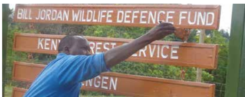
Maintenance of the signboards

The maintenance of the 400 km Aberdare fence has been on-going since its completion in 2009, with 114 fence attendants working daily on the fence. This also includes the rehabilitation of the fence sections that are over 20 years old: 23 kilometres of the 38 kilometres of Phase I have been entirely rebuilt; strainers assemblies along 14 kilometres (of the 40 kilometres) of Phase II have been rebuilt to date. It is expected that the strainer assemblies along the entire Phase II will be rebuilt by end of February 2019.