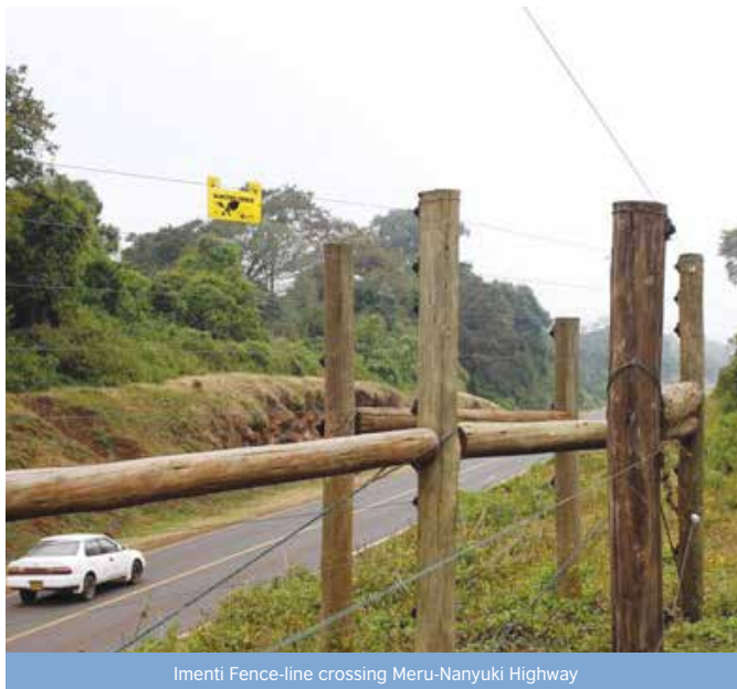
Imenti Fence-line crossing Meru-Nanyuki Highway

In an effort to sustainably conserve the King Muuru and surrounding forest, the Community Forest Association (CFA) Meru Forest Station is seeking support of Rhino Ark to help in its gazettement as a National Monument and market it as a tourist attraction site