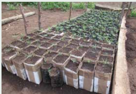
Improved potting boxes at Elementaita Primary School nursery

In tandem with the Conservation Education programme, Rhino Ark is continuing to implement model tree nurseries in selected schools around Eburu Forest. So far, a total of seven schools, Emmanuel and Ndabibi Primary in Ndabibi Location, Loldia Primary in Malewa Location, Eburru and Songoloi Primary in Eburru Location, Morop Primary in Ol Jorai Location and Elementaita Primary in Kiambogo Location are fully operational. Pupils in these schools receive detailed practical training in growing tree seedlings and actively participate in tree nursery management in their respective schools. To address challenges posed by the ongoing (national) shortage of potting tubes for seedlings, the school nurseries have innovated by recycling paper packing cartons as alternative materials for potting tubes.