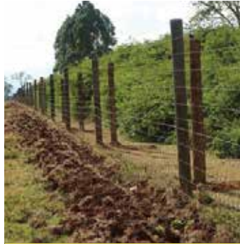
Rehabilitation of the Aberdare Fence Phase 1 on-going at Wamugis Corner