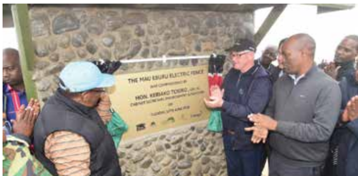
Cabinet Secretary, Ministry of Environment & Forestry, Hon. Keriako Tobiko and H.E Lee Kinyanjui, Governor Nakuru County unveil commissioning plaque