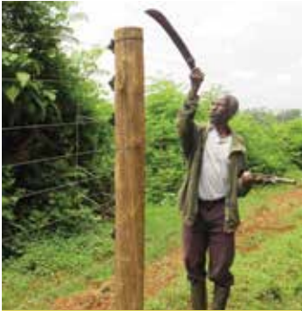
CFA Member at Kabage Forest Station points at Baboon proof loops installed on the Aberdare Fence as rehabilitation progresses