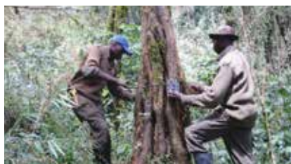
Camera set up by team