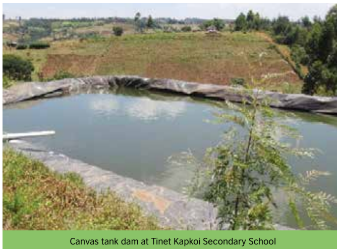
Canvas tank dam at Tinet Kapkoi Secondary School