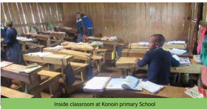
Inside classroom at Konoin primary School

In preparation for implementation of a conservation education programme, a preliminary survey of schools was carried out between February and March 2018, by the Rhino Ark outreach team. This first survey identified 31 schools within 5km of the forest cut line. A follow