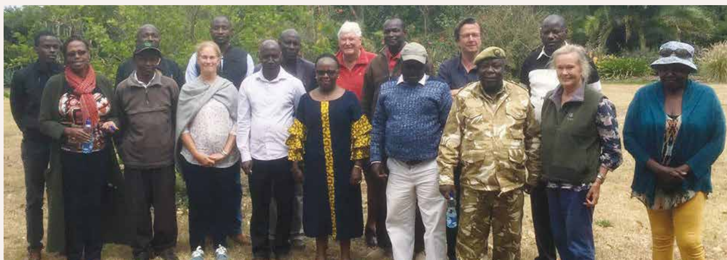
The landowners and stakeholders that attended the meeting

Landowners in the proposed Mt. Kenya-Aberdares Wildlife Corridor met at the Sangare Wildlife Conservation on 22nd September 2018 to discuss legal options to establish the corridor.