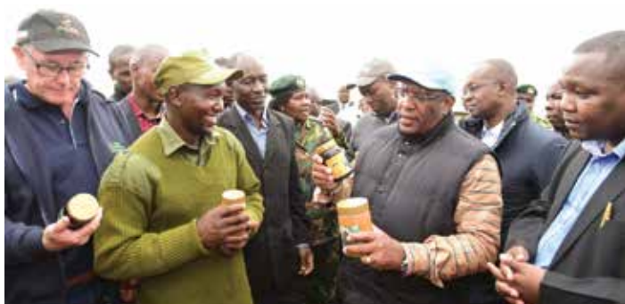
CS Keriako Tobiko discussing honey production at Ogiek home