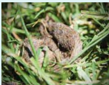
Leopard scat at the fence line