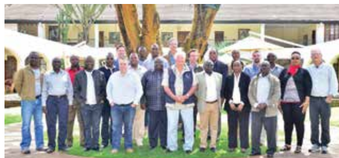
Participants in the one-day workshop on the recovery and conservation of the mountain bongo, held at the Mount Kenya Safari Club on 9th December 2017.

The Mountain Bongo is a large forest dwelling antelope that lives at high altitude in dense indigenous forest. It is a critically endangered species only found in Kenya. Fewer than 100 mountain bongos are thought to exist in the wild, all in the Aberdares, Mt. Kenya and the Mau Forests Complex.