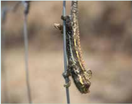
Survivor: a Von Hohnel's chameleon in fire-ravaged area