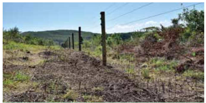
Completed and powered section of western boundary corridor fence

Great progress is being made towards fully securing the wildlife corridor that links Eburu forest and Lake Naivasha, through construction of game-proof fencing. The eastern boundary of the corridor was fence was completed in February 2016, and a survey of the western boundary carried out in June 2016, providing a roadmap for the construction work. The survey identified two sections that required fencing. The first section covers 851-metres from the forest boundary to a steep hill formed by a lava flow which acts as an impenetrable 1,500 metre long natural barrier along the corridor's edge. The second section is a 1,950-metre long stretch from the opposite side of the hill, starting at St. Andrews Secondary School and ending at the boundary of Rubi Ranch, near Kasarani shopping centre along the Moi North Lake Road.