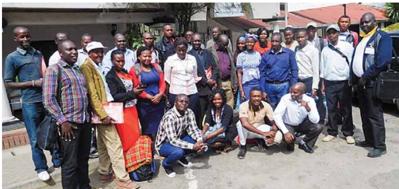
Conservation education workshop group

On 21 April 2017 Rhino Ark facilitated a conservation education workshop for teachers in Naivasha. The workshop provided an opportunity to induct new teachers into the programme and share experiences and best practices. Officials from the Ministry of Education participated in the workshop, together with 8 newly inducted Eburu Conservation Champions. The champions, drawn from each of the locations adjacent to Eburu forest are a team of community volunteers who will support the outreach programme. The teachers and champions team now has an active social media group with Facebook and WhatsApp platforms now in use. These forums are proving invaluable to rapid dissemination of information amongst members and also in highlighting threats to the forest such as forest fires.