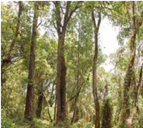
Prunus africana trees