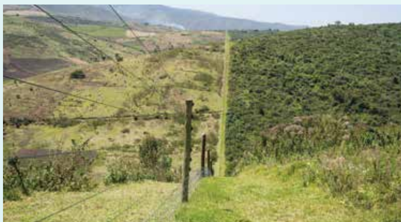
Regenerating forest inside the fence at Centre One

The south western part of Eburu Forest Reserve holds intact, closed-canopy high forest rich in biodiversity. The mountain buzzard ( Buteo oreophilus ), is a Near-Threatened bird species that is among the denizens of the area. Adjacent to the forest is vast farmland belonging to the Agricultural Development Corporation (ADC).