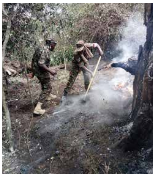
KDF personnel from the 4th Brigade extinguishing fires on 21st March 2017.