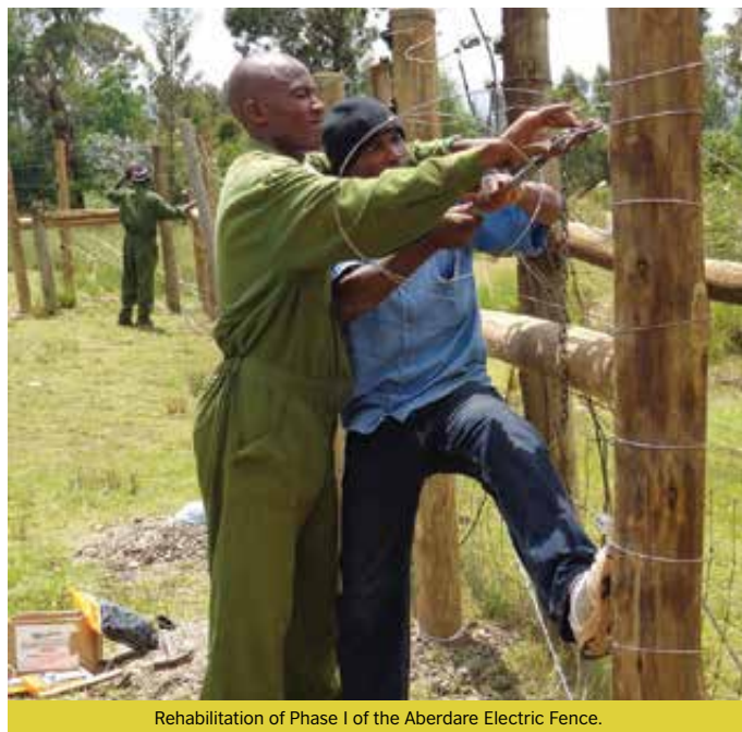
Rehabilitation of Phase I of the Aberdare Electric Fence.

As the electric fence on Mt. Kenya is progressing well with over 150km built to date and early preparations are being made towards fencing part of South Western Mau Forest Reserve, Rhino Ark remains committed to, and directly engaged in the day-to-day maintenance of the 400km Aberdare Electric Fence. Routine fence maintenance is carried out by a team of over 100 fence attendants recruited from the forest-adjacent communities.