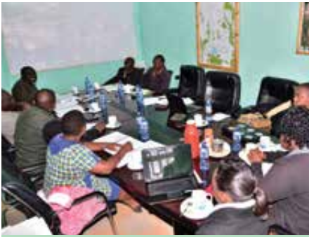
Technical session of PFMP committee

A key milestone in the management of Eburu forest is now imminent, namely the delivery of a 5-year, comprehensive Participatory Forest Management Plan (PFMP). The implementation of current PFMPs is a legal requirement for all forest reserves. Despite this requirement, Eburu Forest Reserve has lacked a current PFMP since the expiry of the previous (2008-2013) PFMP. Various attempts by stakeholders to review and update the plan had been unsuccessful until June 2016. With technical and financial support from Rhino Ark, the PMFP review process was rebooted, with the formation of a dedicated technical committee comprising a multi-skilled, cross sectoral team, in which