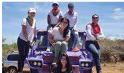
The Pink Horns team

The Pink Horns hosted an event on Friday 17th March to raise funds for Rhino Ark. The team is made up of six young, energetic and fun-loving women (half of them are mothers) who have come together in the efforts to help conserve our wildlife for their children and their children's children.