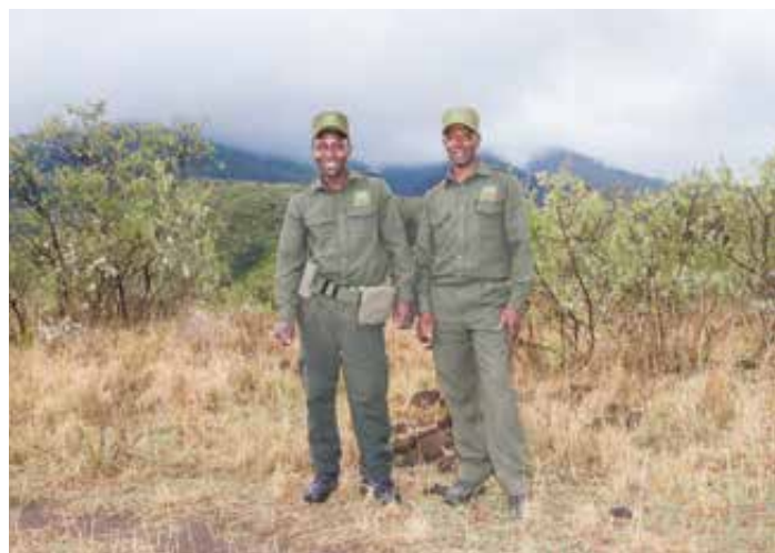
Fence team in branded kit

Through support from Rhino Ark, the Eburu fence maintenance team has received new uniforms. The uniforms, which the Kenya Forest Service (KFS) has branded with its logo, enable the fence team to work comfortably and safely, and be easily identified as members of the Eburu KFS team. Towards maintaining operational efficiency, the team has also received replacements for tools and equipment that have been worn out as a result of daily maintenance routine.