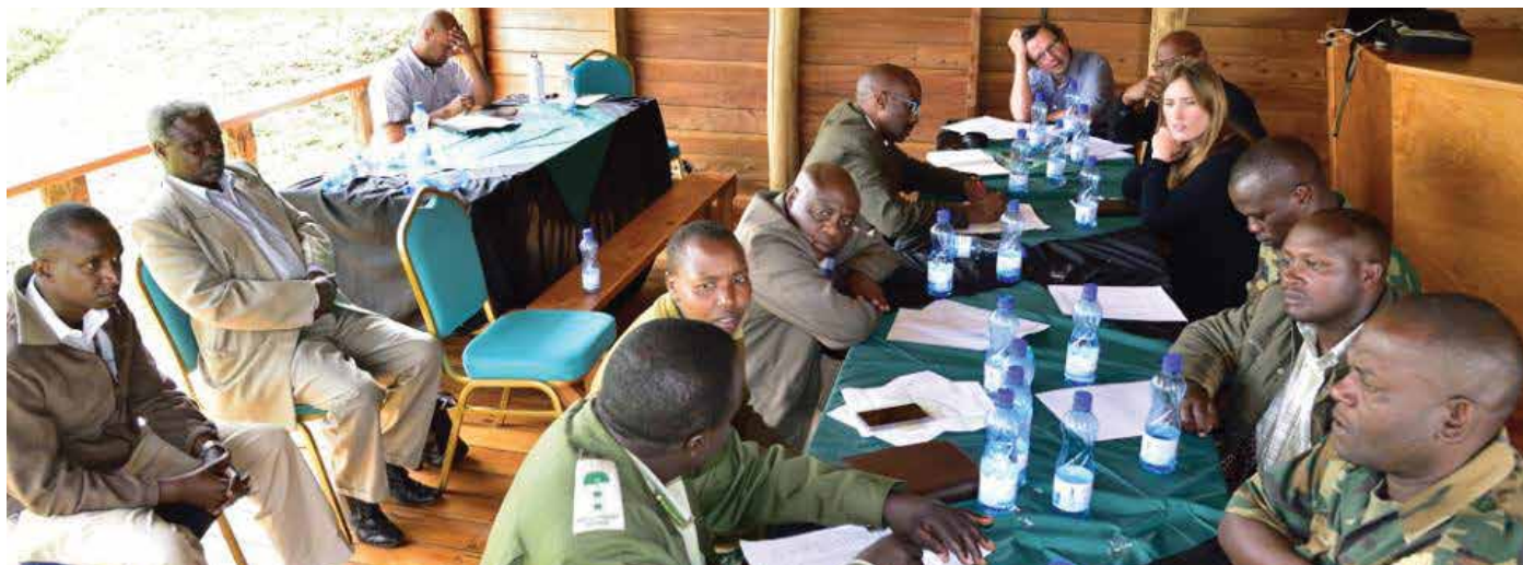
Debriefing session following the surveillance flight conducted on 24th February 2017.

As part of the South Western Mau landscape conservation project funded by the Dutch-based Sustainable Trade Initiative (IDH), Rhino Ark is coordinating periodic surveillance flights above the 60,000 hectares of South Western Mau Forest Reserve and parts of Western Mau Forest Reserve. The 5th flight was conducted on 24 February 2017. Participants in the flight included the Chairman of Safaricom Foundation, Senior Manager for Safaricom and MPESA Foundations, KFS Head of Research Liaison & Project Development, KFS Zonal Manager for Bureti, KWS Deputy Warden for Bomet and Kericho counties, Rhino Ark Executive Director and Rhino Ark Mau