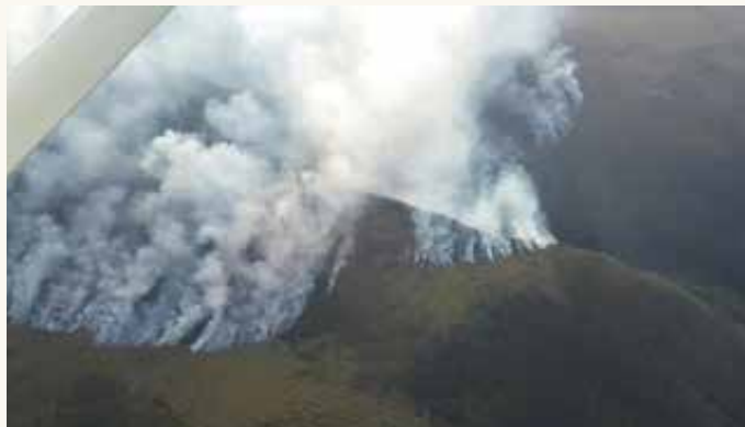
Wildfire raging in the northern moorlands, Aberdare National Park.

On January 20th 2017, the wildfires raging in the moorlands of Northern Aberdares were extinguished. This was as a result of a strong partnership between KWS, KFS, Rhino Ark and the local communities.