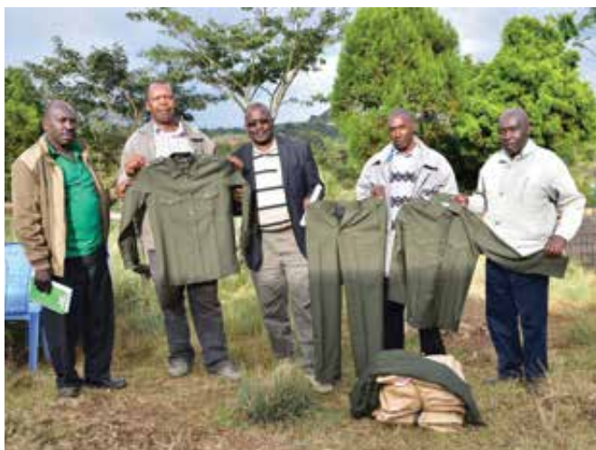
KFS management team receives uniforms