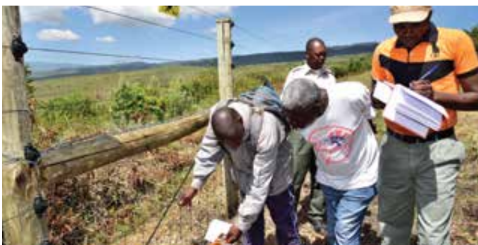
Corridor committee inspects the fence