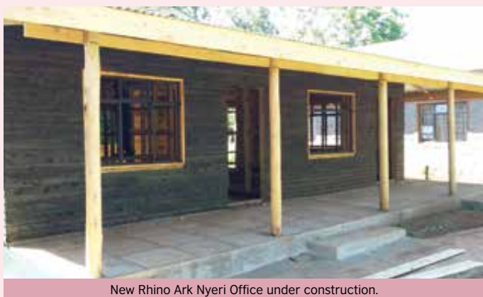
New Rhino Ark Nyeri Office under construction.

Rhino Ark Nyeri Office will soon move to the KWS King'ong'o Station. The new office is currently being built and should be ready by early July. Last year, Rhino Ark signed a 10 years lease agreement with KWS with a peppercorn rent.