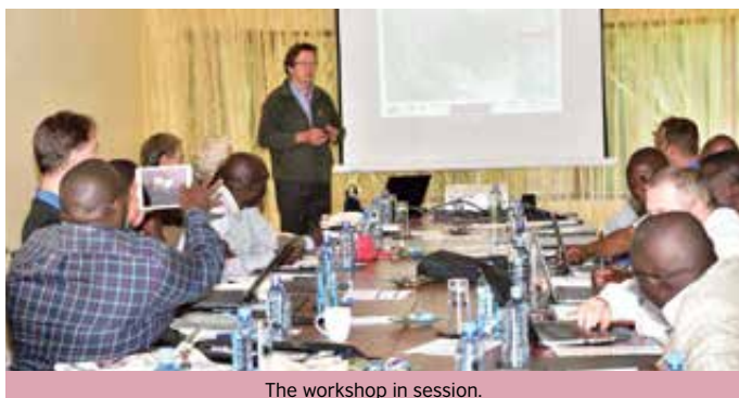
The workshop in session.