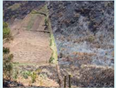
A section of fence line impacted by fire

The extended dry spell affecting most of the country did not spare Eburu forest. The hot and dry conditions essentially converted the lower elevations of the forest into a tinderbox, simply awaiting a reckless or malicious spark.