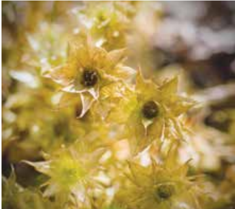
Flower at steam vent