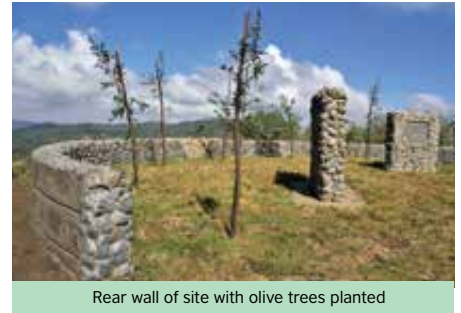
Rear wall of site with olive trees planted

The Ngobobo Hill is a dominant feature of the eastern boundary of Eburu Forest landscape. It offers commanding views of Lake Naivasha and Mount Longonot to the south east, the eastern Mau forest range to the south west and the lower, forested sloped of the southern part of Eburu forest.