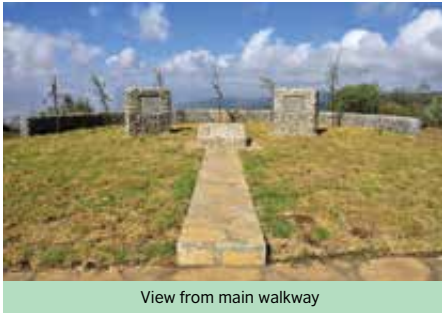
View from main walkway