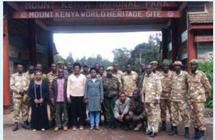
Participants in the training workshop on the prosecution of wildlife crimes held on 20-21 January 2017.