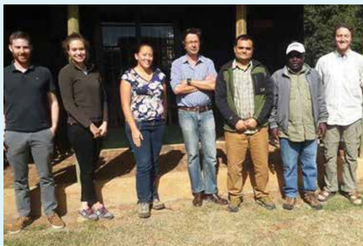
GEF evaluation team together with Rhino Ark Executive Director and KWS Senior Warden at Naro Moru on 20th January 2017.

An evaluation team from the Global Environment Facility (GEF) based in Washington, DC, visited Kenya in January 2017 with the purpose of evaluating the IFAD/GEF-funded Mt. Kenya East Pilot Project for Natural Resources Management (MKEEP) that was completed four years ago. The team also visited Rhino Ark/KWS/KFS fencing project.