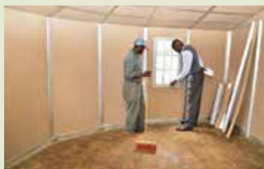
Inspection of inside of unihut.