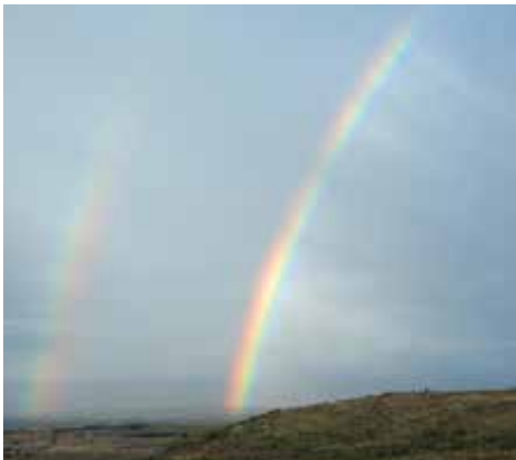
Twin rainbow on landscape