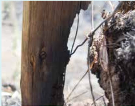
A charred fence post