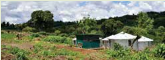
View of camp and surroundings.