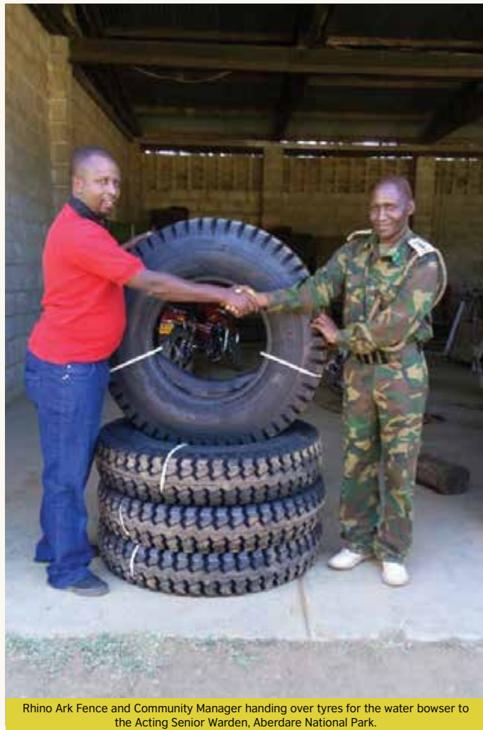
Rhino Ark Fence and Community Manager handing over tyres for the water bowser to the Acting Senior Warden, Aberdare National Park.