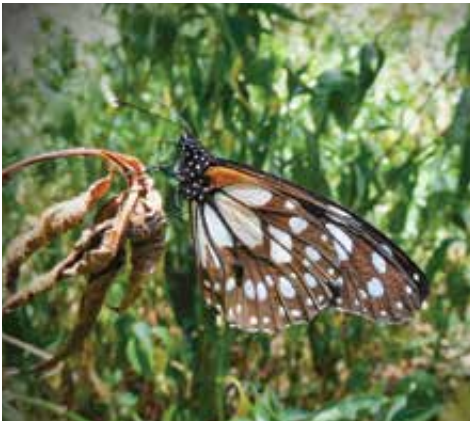
Beautiful tiger butterfly