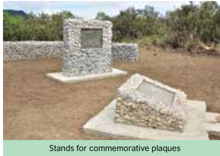
Stands for commemorative plaques