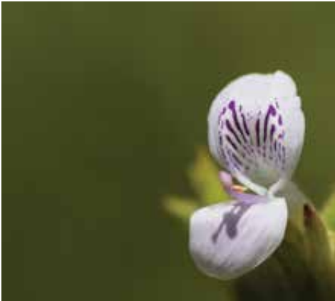
Flower in the central forest area