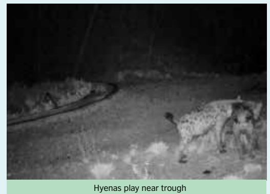
Hyenas play near trough