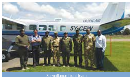
Surveillance flight team.

Although the forests were largely found quiet, there were two new areas with growing marijuana located deep in the forest, with nearby logging sites of camphor trees. The team participating in the flight discussed at length these new threats and agreed on joint interventions.