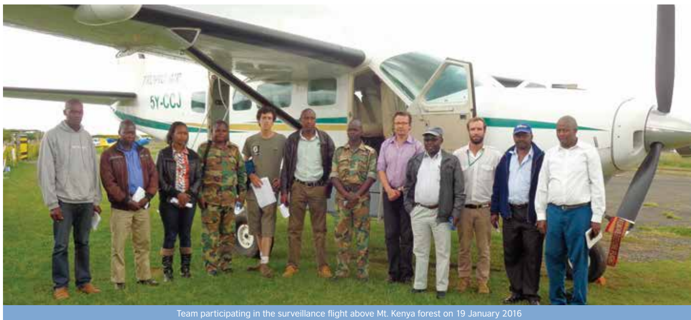
Team participating in the surveillance flight above Mt. Kenya forest on 19 January 2016

Rhino Ark, together with Kenya Forest Service, Kenya Wildlife Service and Mount Kenya Trust, carried out a surveillance flight above the forest of Mt. Kenya located in Embu County and part of Tharaka-Nithi County. The purpose of the flight was to monitor illegal activities, in particular the logging of indigenous trees.