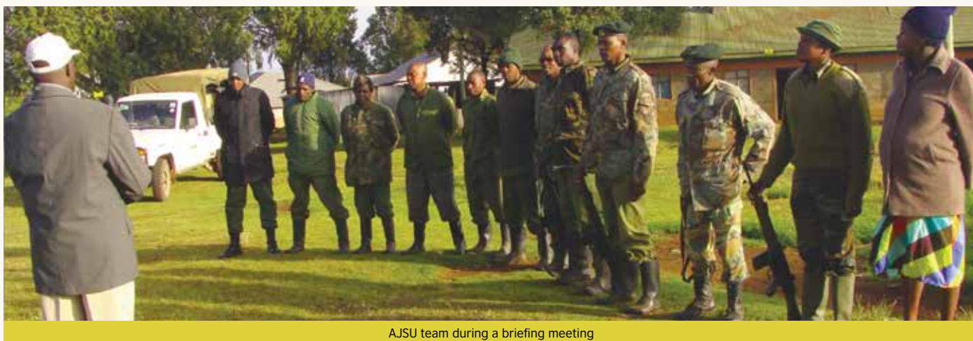
AJSU team during a briefing meeting

The Aberdare Joint Surveillance Unit (AJSU) conducted three operations in the Northern Aberdare: