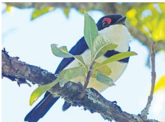
Male black throated wattle eye

The Kenya Bird Map is a project of the Bird Committee of Nature Kenya (the East African Natural History Society) and other local and international partners. The work of this project is making an invaluable contribution to the public knowledge about Eburu's bird life, and the official Eburu birds check list will be shared once it is produced.