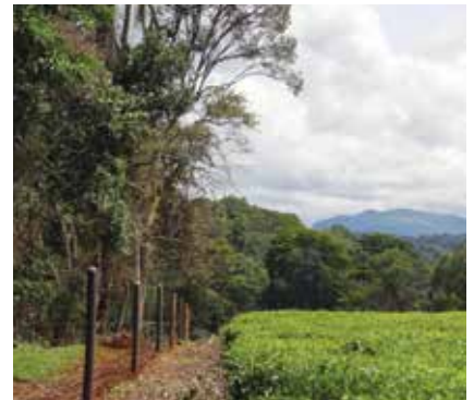
Electric fence along Chuka Forest, Phase II