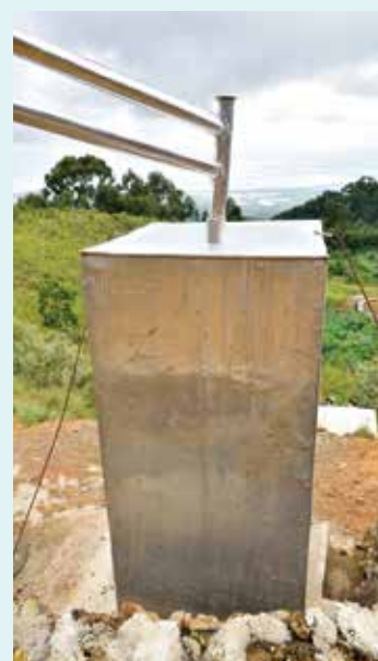
Condenser unit for steam vent