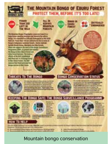
Mountain bongo conservation