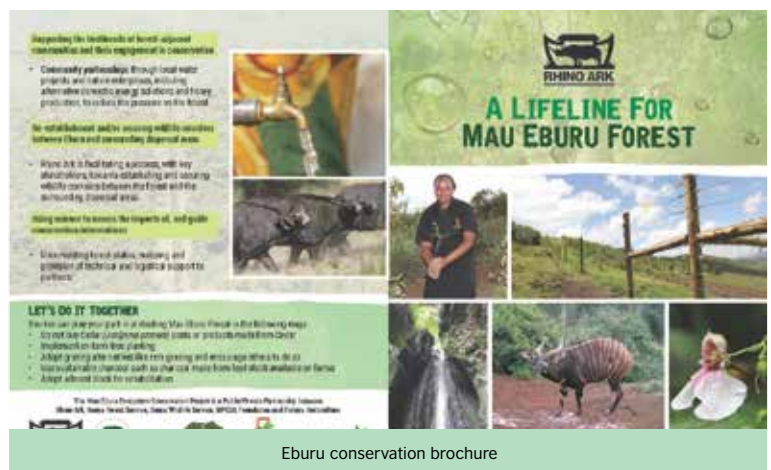
Eburu conservation brochure