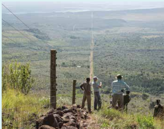
Completed fence facing Lake Naivasha