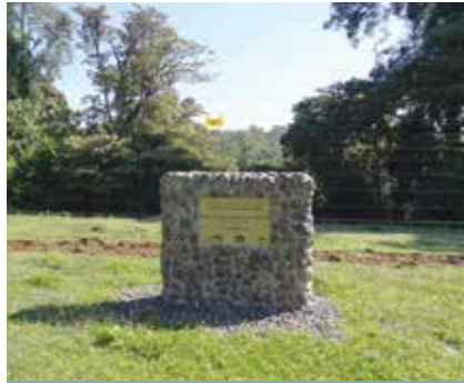
Plaque commemorating the launch of the Mt. Kenya Electric Fence, 9 September 2012

The fence construction was launched on 9 September 2012 by Hon. Njiru Githae, then Minister for Finance. The fence is built in phases, each of them under a separate management agreement signed among the financing partners