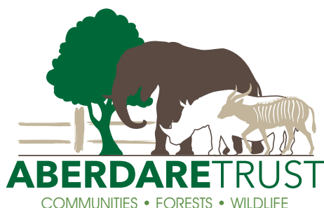
Aberdare Trust Logo

The second meeting of the Trustees of the Aberdare Trust was convened on 22 March 2016. The meeting main focus was on (a) the finalization of the Job Description and Vacancy Advert for the CEO position; (b) the review of a transition plan from the current fence maintenance arrangements to the Aberdare Trust; (c) the adoption of the Aberdare Trust logo; and (d) the opening of a bank account.