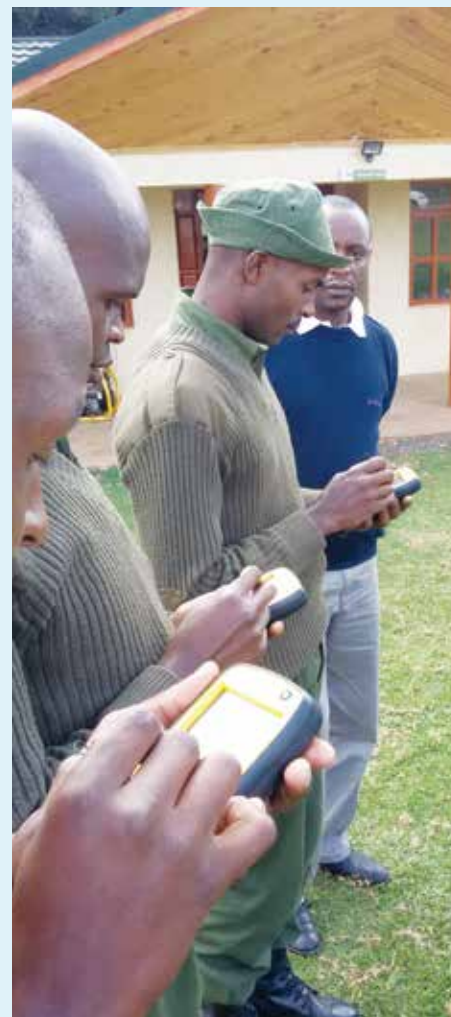
KWS Rangers and Mount Kenya Trust scouts using the state-of-the art GPS of the Patrol Monitoring System

Once fully tested the system will be deployed to all patrol teams on Mt. Kenya.