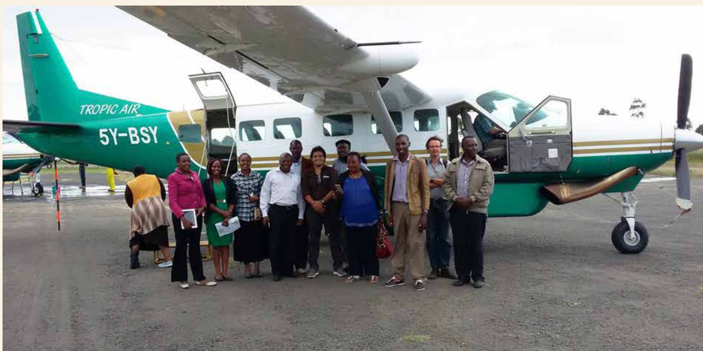
Aerial surveillance team