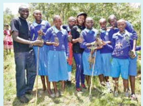
Pupils from Ol Jorai Primary School with seedlings