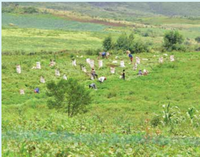
Farming activity outside the fence