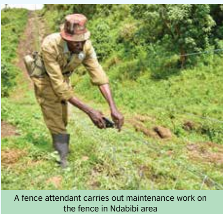
A fence attendant carries out maintenance work on the fence in Ndabibi area