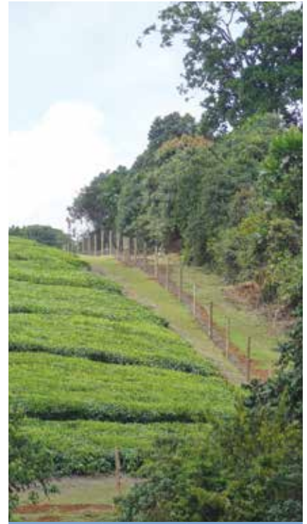
Electric fence, Phase I (Kiringa River – Thuchi River)