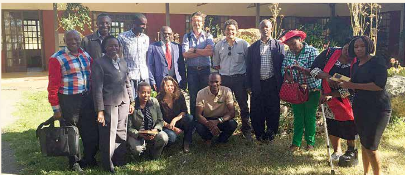
Mt. Kenya-Aberdare wildlife corridor workshop with the members of the County Assembly of Nyeri.

Following the engagement with the local leaders, one-to-one meetings with land owners are now being held. The response by the MCAs is positive with all land owners met so far interested in the wildlife corridor proposal.