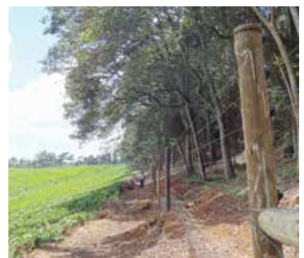
Electric fence along Chogoria Forest, Phase II