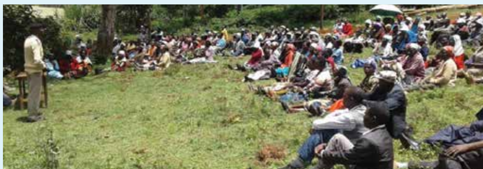
Meeting with the Ruthumbi Community Forest Association