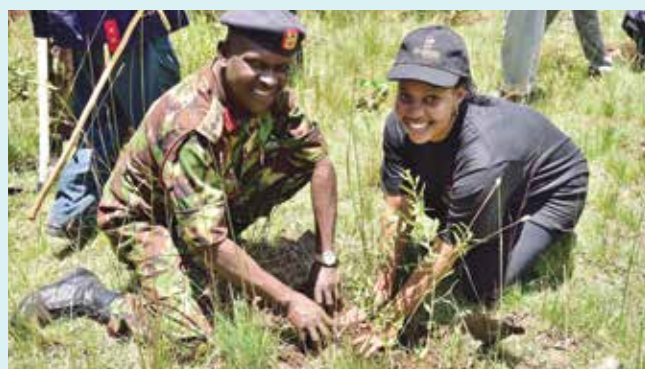
KDF officer plants a tree with MPESA Foundation staff