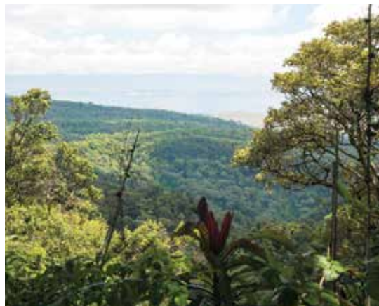
View point facing lake Naivasha

The western summit peak point, which is 4.1km from the trail starting point, can be reached in a comfortable 3 hours of hiking. From the peak the trail descends sharply, leading to the Lengina Dam (a colonial era relic) and then on towards the exit at Morop which lies to the north of the forest.