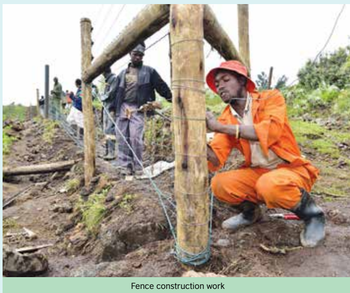
Fence construction work