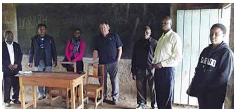
SOH Bondeni before the renovation