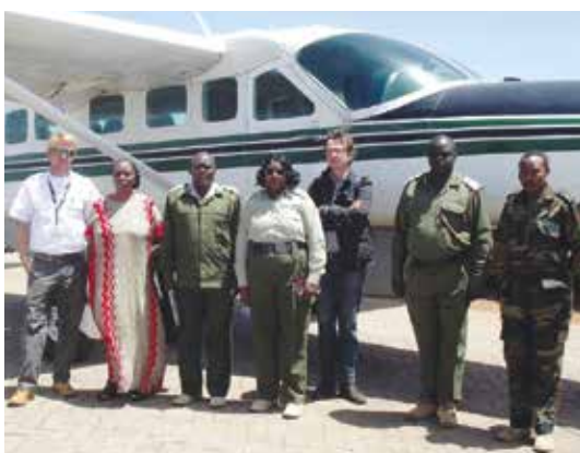
Team participating in the surveillance flight above South Western Mau on 25 February 2016

As part of IDH/ISLA project, Rhino Ark is coordinating quarterly surveillance flights above the 60,000 hectares of South Western Mau Forest Reserve and parts of Western Mau Forest Reserve. The second flight was conducted on 25 February 2016. Participants in the flight included the Bomet County Minister for Environment, KFS Ecosystem Conservator for Bomet County, KFS Ecosystem Conservator for Kericho County, KWS Warden for Bomet and Kericho counties, Rhino Ark Executive Director and Rhino Ark Fence and Community Manager.