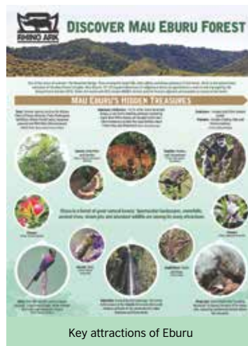
Key attractions of Eburu

The materials, produced with support from the MPESA Foundation, are in the process of being disseminated to the stakeholders at local level, with a focus on local schools, community opinion leaders, community hubs, and partner institutions, among others. The content is also available for downloading from Rhino Ark's website, to make it accessible to a wider audience.