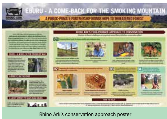
Rhino Ark's conservation approach poster