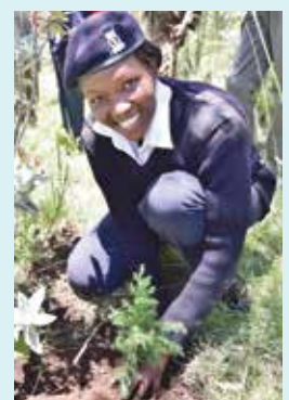
Police officer plants a tree