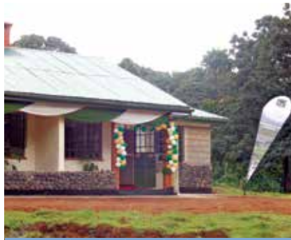
Completed energizer house at Castle Forest Station (Phase I)