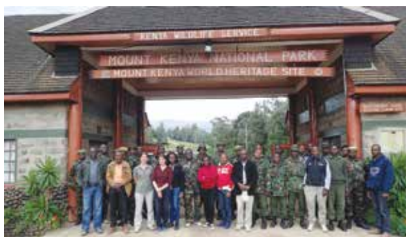
Participants in the Forest Elephant Census / Forest Health Survey

32 rangers and scouts, seconded by KWS (20), Rhino Ark (5), Mount Kenya Trust (4) and Bongo Surveillance Programme (3), participated in the most intensive forest elephant censuses & forest health surveys ever undertaken on Mt. Kenya. Organized in eight teams of four persons, they surveyed close to 500 transects of 200 metres. The exercise started on 27 January 2016 and was completed in one month.