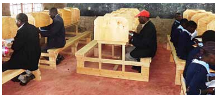
SOH Bondeni equipped with desks and textbooks