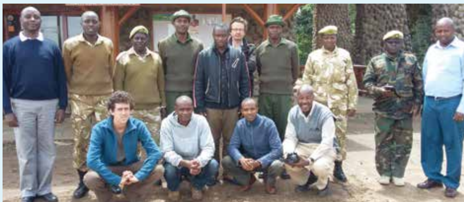
Participants of the training in the Patrol Monitoring System held on 20-22 January 2016

With technical support from ESRI – one of the world leading mapping software companies - and Kenya Wildlife Service, Rhino Ark completed the development of a Patrol Monitoring System for Mt. Kenya. Four rangers from KWS and two scouts from Mount Kenya Trust were trained in the use of the system that was tested over a period of six weeks.