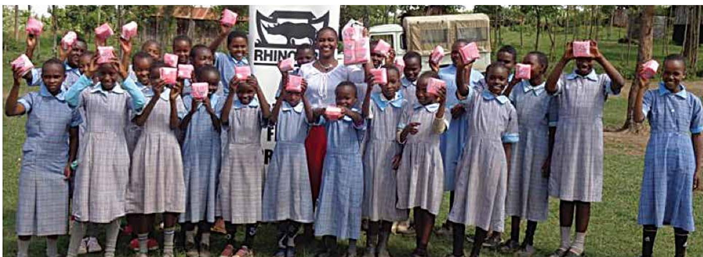
SOH Bondeni pupils receives sanitary towels