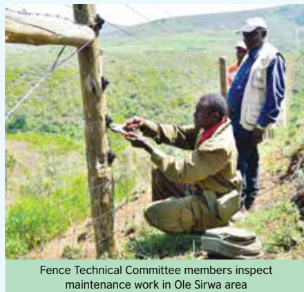
Fence Technical Committee members inspect maintenance work in Ole Sirwa area

The 43.3 km long Eburu Electric Fence, completed in November 2014, is now over 1 year old. The fence is maintained by a 12-man team comprising 11 fence attendants and one supervisor, all reporting to the Kenya Forest Service Eburu Forest Manager. The implementing partners for the fence project, comprising Rhino Ark, Kenya Forest Service and Kenya Wildlife Service continue to guide and support the fence maintenance process