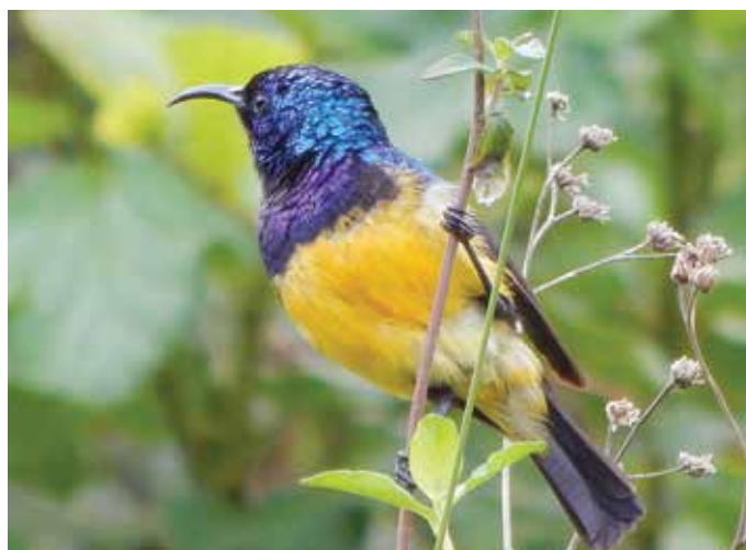
Male variable sunbird