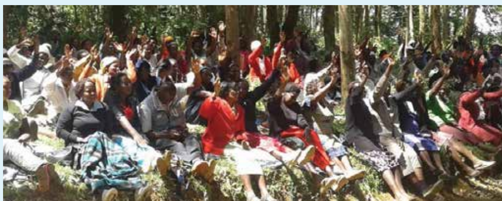
Members of the Marimba Community Based Organization (Ruthumbi Forest) raise their hands as a sign of commitment to the protection of the Mt. Kenya Electric Fence

The meetings were chaired by the area Chiefs and over two thousand community members were reached out. The various speakers focused on fence construction process, gate management, Wildlife Conservation and Management Act, Forest Act and bio-enterprises.