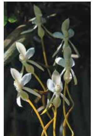
Orchid flowers along the trail