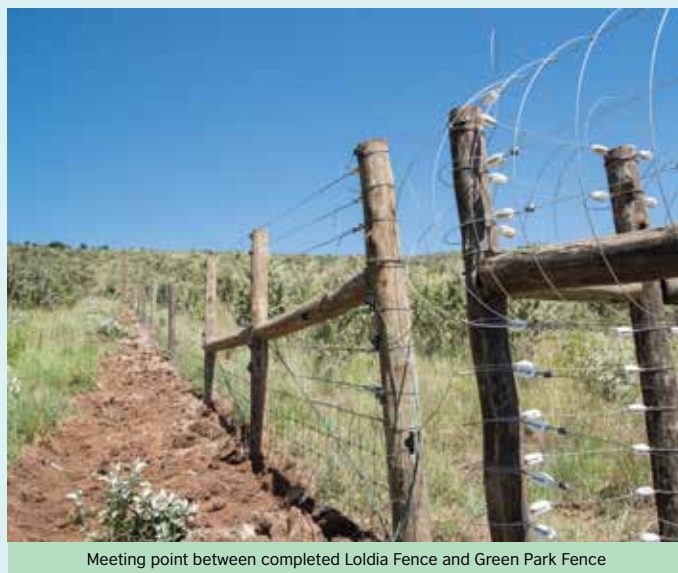
Meeting point between completed Loldia Fence and Green Park Fence

Various large farms within the area between Eburu Forest and Lake Naivasha have over the years hosted wildlife within them, thus providing crucial space to sustain the wildlife populations that move between Eburu Forest and Lake Naivasha. These farms offer the wildlife seasonal grazing, breeding areas and water access. However, the boundary fences between the farms and neighbouring communities are often not built to a game-proof standard. This has allowed movement of wildlife into the neighbouring community areas – a situation that has allowed the conditions for human/wildlife conflict to persist. Loldia Farm, which immediately borders Eburu Forest to the east and south east, is the area through which wildlife transits out of the forest and defines the start of the wildlife corridor towards Lake Naivasha.