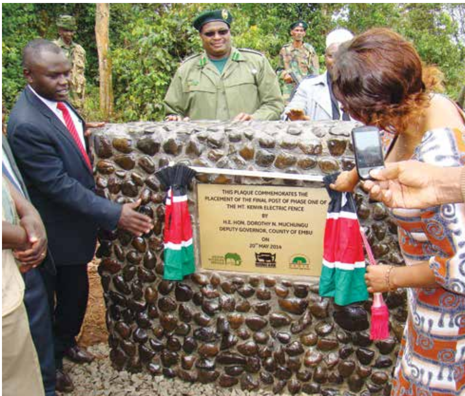
Commissioning of the completed of Phase I