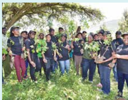
MPESA Foundation staff with tree seedlings to be planted

The 5,000 seedlings were planted within an area of 2 hectares, which is adjacent to a previous tree planting done by the MPESA Foundation in year 2015 covering 1 hectare.